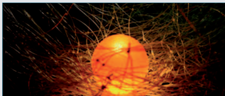
Fig. 2 - The Inexplicable Energy. Try and penetrate with our limited means the secrets of nature and you will find that, behind all the discernible concatenations, here remains something subtle, intangible and inexplicable. Veneration for this force beyond anything that we can comprehend is my religion (Albert Einstein).

Subiaco and after in Monte Cassino (Fig. 1). From there, they quickly spread this particular and simple monastic life and culture around Europe. Effectively, these monastic systems had a primordial role on Europe, congregating and organizing many and many populations around its structures and offering protection, knowledge, health care and spirituality. So, its contagious personality based on its dynamic and operational influence, intellectual, social and spiritual characteristics, deep and positively changed the face of Europe. This was reflected throughout the centuries, based on its singular and emblematic sentence "Ora et Labora" and supported by an exemplar, simple and generous life. Curiously much later, other totally different personality, Albert Einstein stated other complementary sentence, quoting: Science without Religion is lame, Religion without Science is blind . For Einstein, the