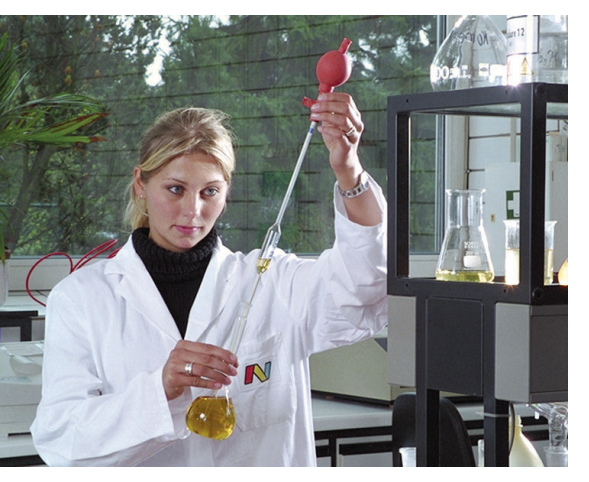
Working in the lab: Mismatch between industry requirements and taught courses.

Two thirds of chemical companies currently have difficulty in filling vacancies. Some shortages arise from a mismatch between the requirements of industry and taught courses, e.g. academia focuses on synthetic chemistry but 40 percent of EU chemical production involves formulation chemistry.