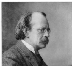
Joseph John Thomson Rays of positive electricity Proceedings of the Royal Society A 89, 1-20 (1913)